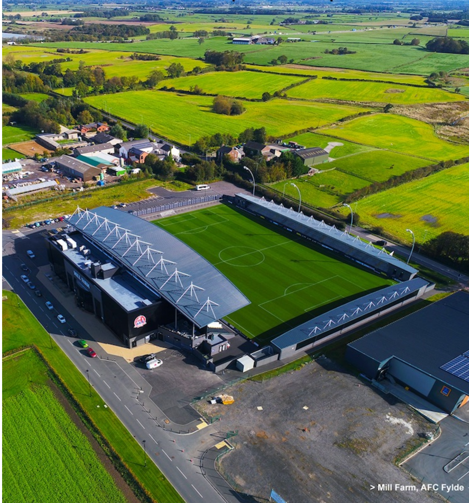
> Mill Farm, AFC Fylde

architecture • project management • structural engineering • interior design building surveying • m&e design • quantity surveying • cdm consultancy